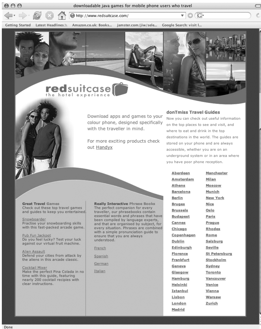
Figure 2.1 The redsuitcase website, www.redsuitcase.com

how can they profit from the wireless world, companies also need to ask how much revenue they are going to make once the idea has filtered its way down to and then through all the other companies above them. It is also worth noting that below network operator level there is now a large number of companies offering very similar services, so to get the most from access and platform providers it's best to consider a number of different options. Some of the best and most imaginative mobile content is coming out of smaller, independent development houses.