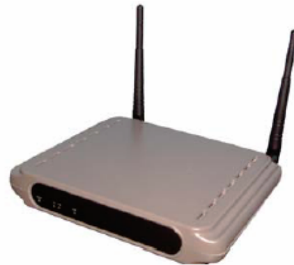
Figure 2 - An example of a customer premises equipment (CPE) unit, the Strix Systems EWS 100 Series.